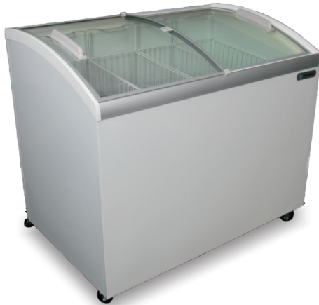
Model MSC-41 Angled top for enhanced product display